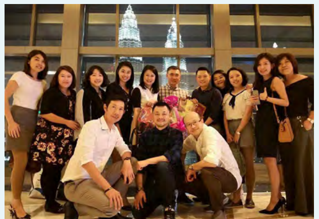
Dinner with Founder & IBOs