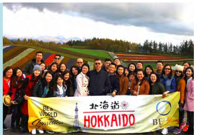
BE Lifestyle Travel to Japan

Yen Wei added, "The best investment you can make on is health. When you invest in health, you'll be on your way to your dream life."