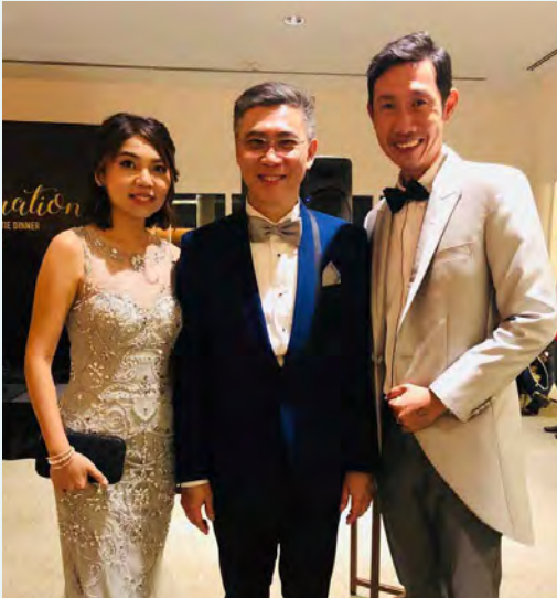
Photo with Founder