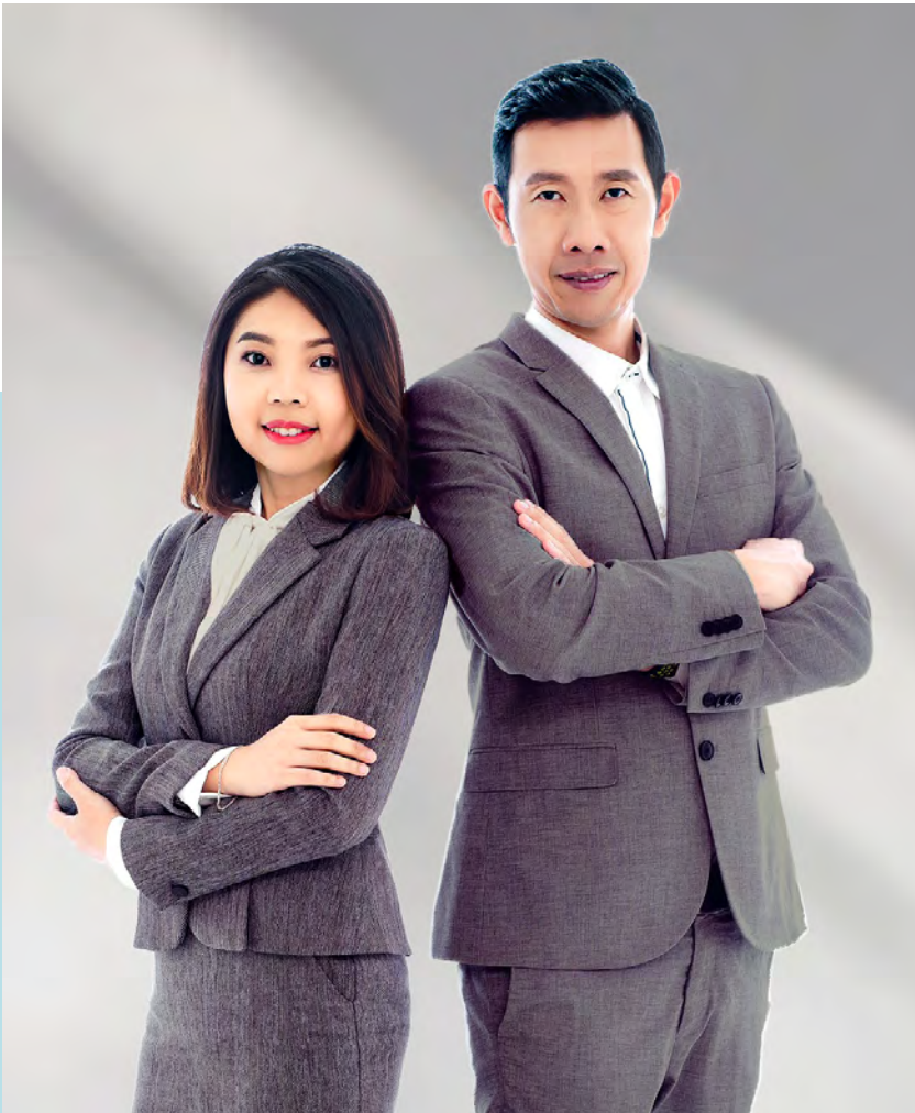
BE recognition night