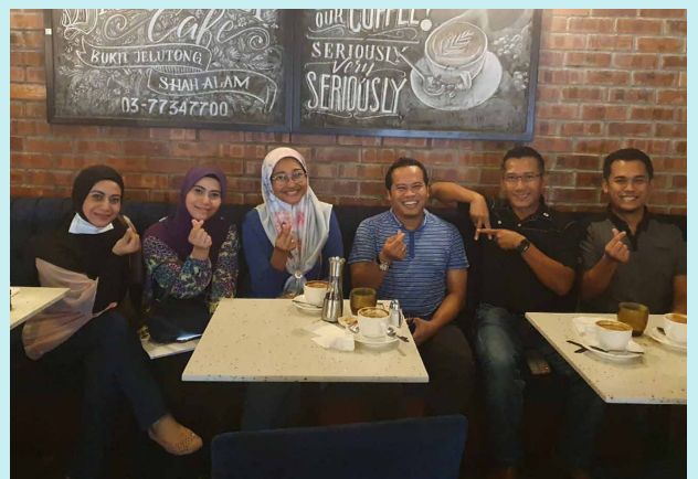
Photo taken with upline