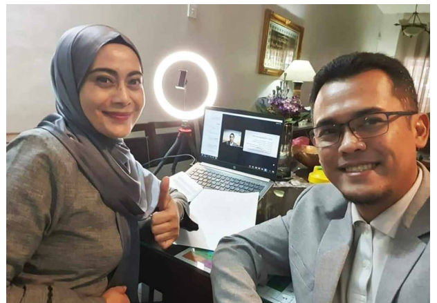
Products Sharing Online

The RCCA couple urged, "Stay long enough to get to know to BE international and let BE help you uncover your potential. Don't run off at the start. Follow through, and you'll understand. You don't need the whole world to believe in you, just a few people or just yourself, to believe in you to make the change. Do that 1% change daily; in the end, you will earn a 365% change in a year.