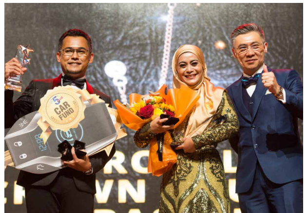
BE Convention 2022