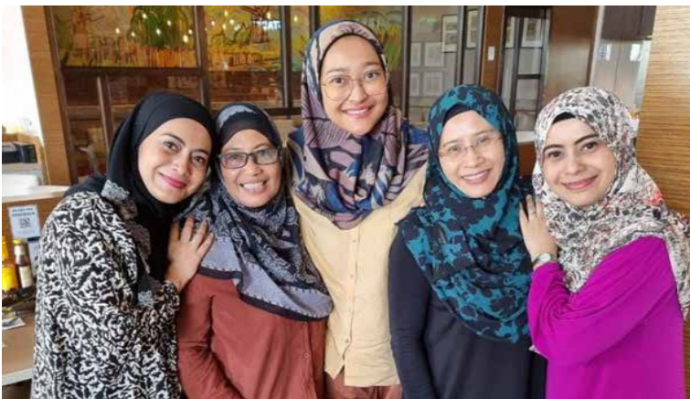
Photo taken with upline